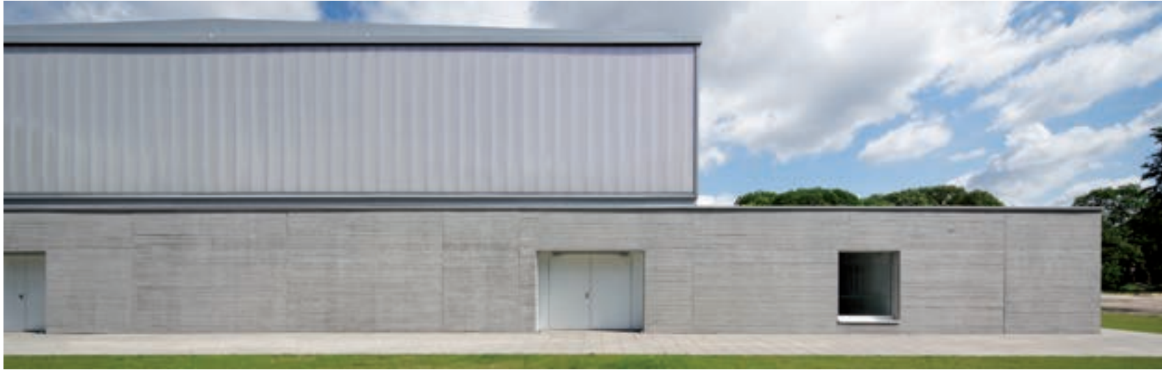
left: Ground floor plan_Concrete base and upper volume. right: Side facing school with school entrance_Sports hall.