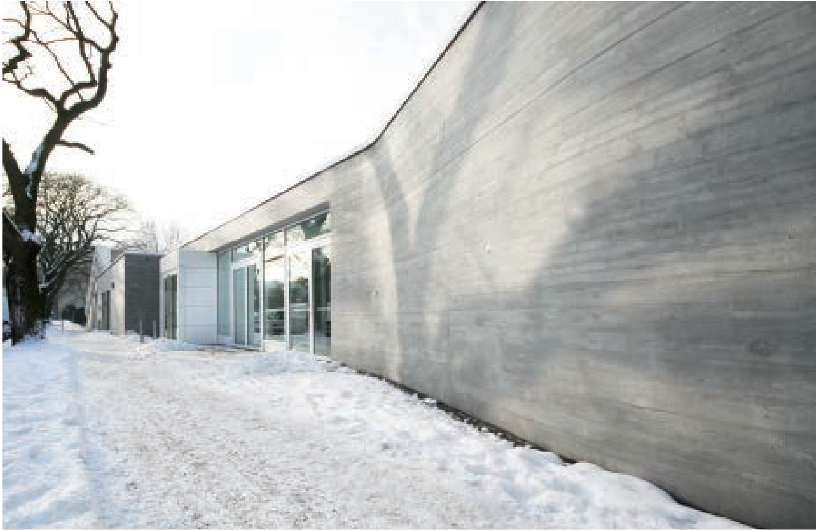
left: Exhibition space. right: Isometric_Entrance to foyer and exhibition space with curving façade.